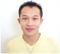
Photo is clear and in color, reproduces skin tone accurately, and is properly exposed with no shadows